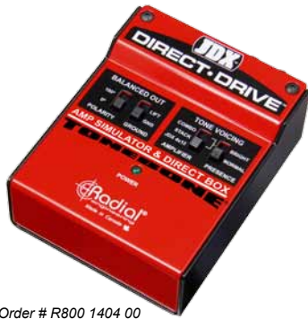
Direct Drive - Order # R800 1404 00

The JDX Direct-Drive™ is a unique device that simulates the sound of a guitar amplifier while doubling up as a direct box. In other words, with the Direct-Drive on a pedalboard, you can do a gig without carrying an amp to the club or record silently using all of your favorite pedals. The design begins with a ¼" guitar input and passive thru-put to feed a stage amp plus a dedicated tuner output. The signal then passes through a series of filters to create Radial's signature JDX™ tone. This is modelled after the sound of a Shure SM57™ in front of a Marshall™ 4-12 cabinet. This is augmented with two amp settings that add the character of a Marshall JCM™ head or Fender Twin™ combo to the mix. These can be further tailored using a presence switch to add extra sparkle. The amp tone signal exits the Direct-Drive via a ¼" guitar level output and a balanced XLR to feed the PA. The Direct-Drive may be powered using a standard 9V power supply or any typical pedalboard power brick.