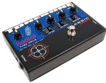
Classic - Order # R800 7010

The Radial Tonebone Classic, modelled after guitar tones from the 60's, 70's and 80's, will take the player from the slight edge and grit of an overdriven vintage combo right up to the power chord and screaming solo tones that make tube amplifiers the only choice for serious tone players.