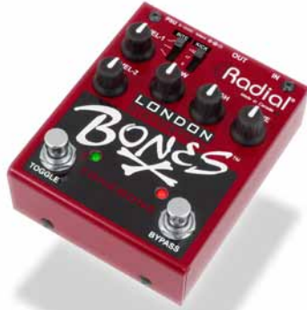
Bones London - Order # R800 7105

The London is a solid state version of the popular Tonebone Hot British-the pedal most players consider to be the best 'Marshall* in a box' made today. It combines three gain stages to create exceptional harmonics and powerful 2-band EQ that lets you dial in the tone as needed.