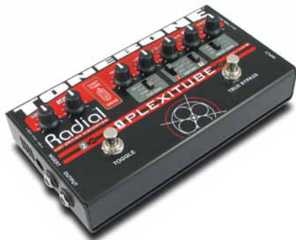
Plexitube - Order # R800 7025

This two channel tube distortion pedal combines the natural warmth and harmonic generation of a 12AX7 tube with the control and saturation of our unique multi-stage drive circuit. This combination provides incredible gain with tons of overtones and, when combined with our unique passive-interactive EQ, produces Marshall Plexi tones worthy of a Shakespearian Ode.