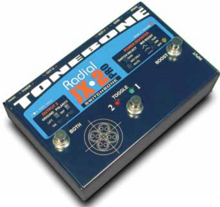
Switchbone - Order # R800 7080

The Switchbone is an ABY box that has been developed to solve the many problems associated with driving two guitar amplifiers without introducing noise, hum or coloration.