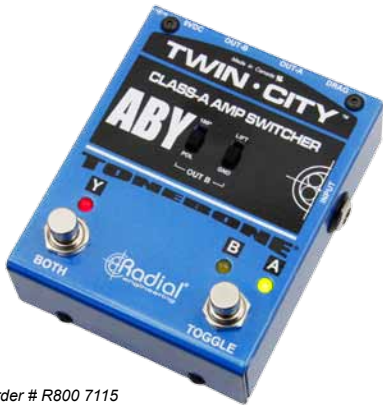
TwinCity - Order # R800 7115

The Radial TwinCity is a, high performance active Class-A guitar amp selector that lets you seamlessly transition between two amps without the switching noise, hum or tone loss generally encountered when using passive switchers.