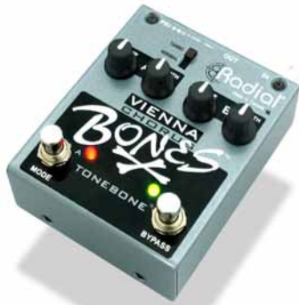
Bones Vienna - Order # R800 7120

The Vienna is a true analogue chorus pedal. In other words, unlike the Boss* or others that employ digital processing to emulate the effect, the Vienna begins with 100% discrete class-A buffers and employs old-school Panasonic MN3007 bucket-brigade chips from the 1980's to create the tone. (Yup, we found a huge cache of these). This delivers a warmer more organic sound which is impossible to replicate using today's ultra-clean digital technology.