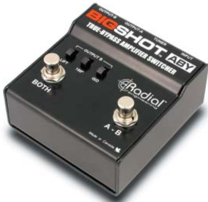
Radial BigShot ABY - order # R800 7200