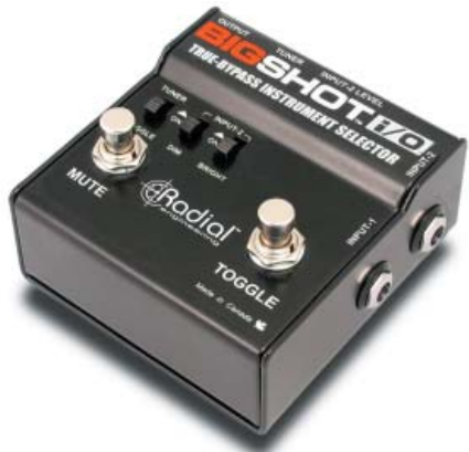
Radial BigShot i/o - order # R800 7202

The Radial BigShot i/o is an easy to use instrument selector switch that lets you quickly transition between two instruments and send the signal to your amp. In the most basic application the BigShot i/o is 100% true-bypass for the most demanding purist. To further enhance connectivity input-B is equipped with a set-&-forget level control called DIM that lets you reduce the signal from the louder of your two instruments so that both instruments are matched to the same volume level. When passive instruments are used, a unique 'bright' switch lets you compensate for high frequency loss due to longer cables.