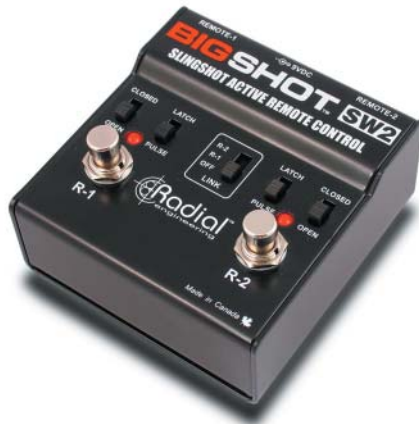
Radial BigShot SW2 - order # R800 7206

The BigShot SW2 is a two channel universal remote control that can be used to replace two amplifier foot switches and combine functions with a single pedal. This is of primary importance for pedalboard users that always find themselves short on space. Both latching and pulse outputs are supported enabling the SW2 to control both older amps with contact closure style channel switching and newer amps with electronic pulse sensing.